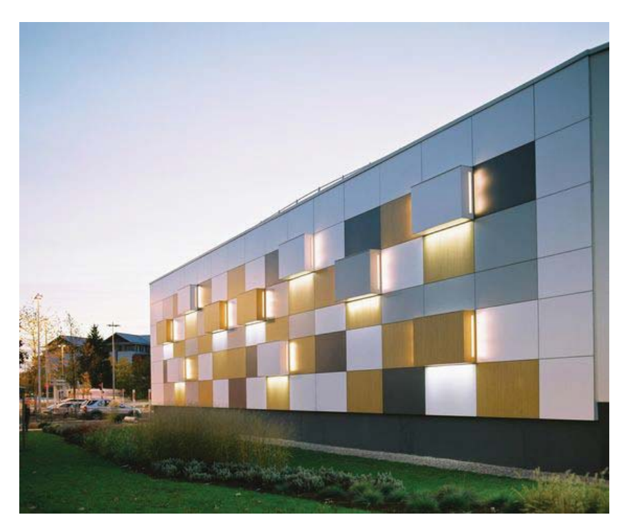
extruded surfaces provide depth of field