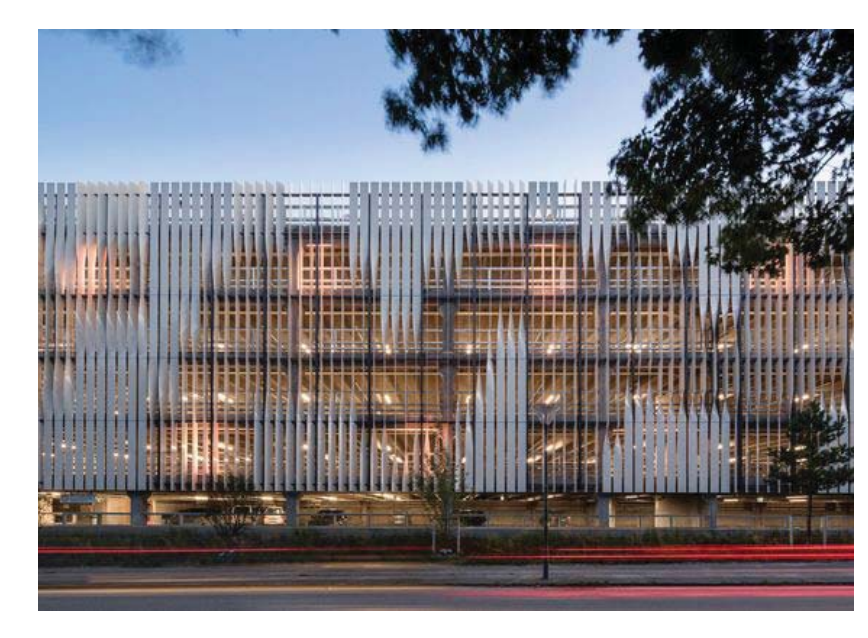
eastland shopping centre louvred carpark facade provides natural ventilation