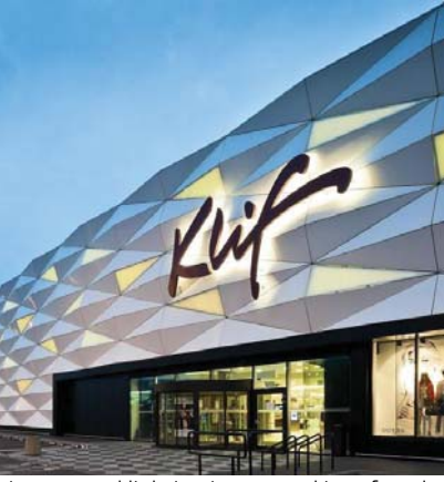
signage and lighting integrated into facade