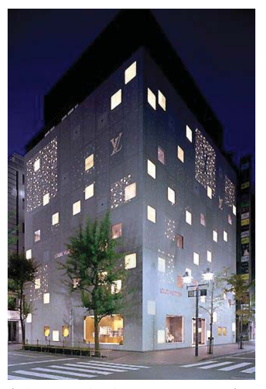
design penetrations in precast concrete so the building can take on another form at night