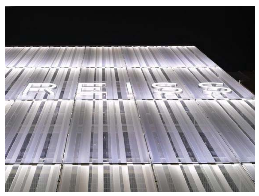
layering facade provides a sense of permeability