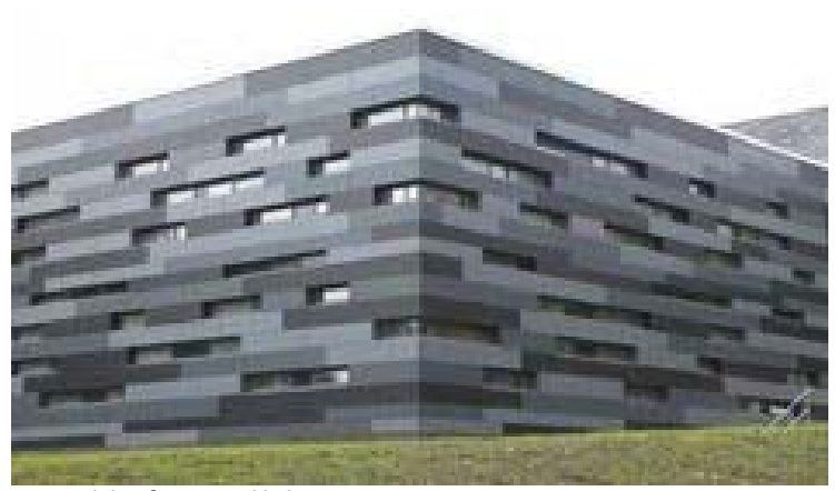
permeability for natural light penetration