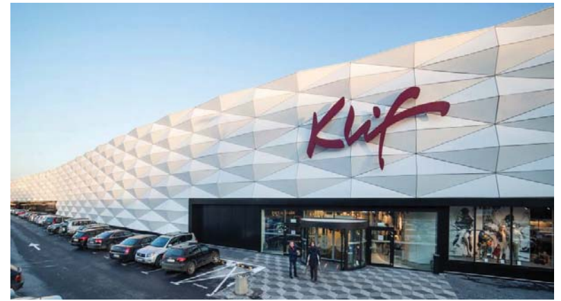
geometric alucobond repetition